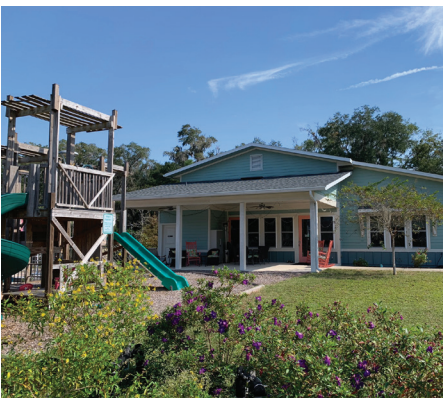
Common House & Playground

To learn more about cohousing contact gainesvillecohousing@gmail | 727-692-2735