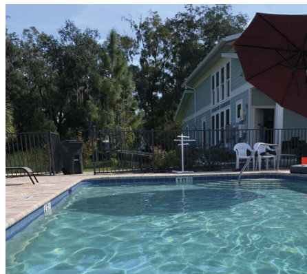
Sparkling Salt Water Pool