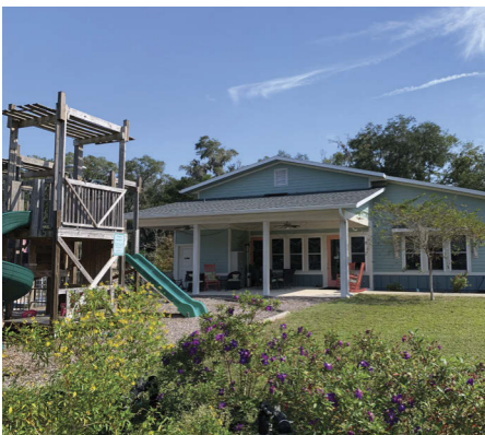
Common House & Playground

To learn more about cohousing contact gainesvillecohousing@gmail.com | 727-692-2735